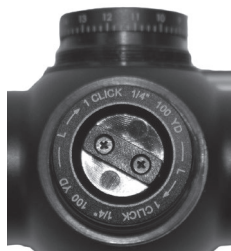
WINDAGE ADJUSTMENT DIAL