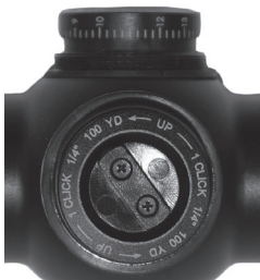
ELEVATION ADJUSTMENT DIAL

This step is not necessary, but, for future reference, you may want to realign the zero marks on the Adjustment Scale Rings with the index dots.